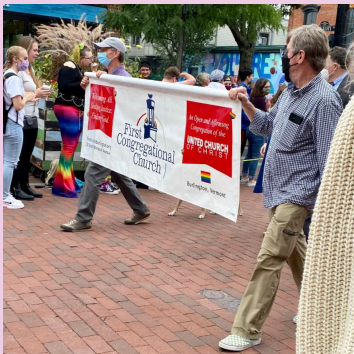
First Congregational of Burlington

Clergy may robe and bring red or a favorite stole.