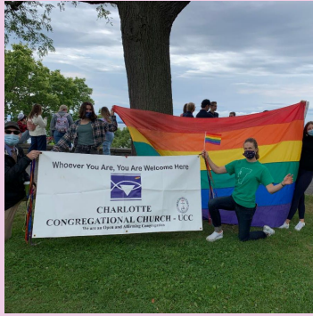
Charlotte Congregational Church