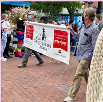
First Congregational of Burlington