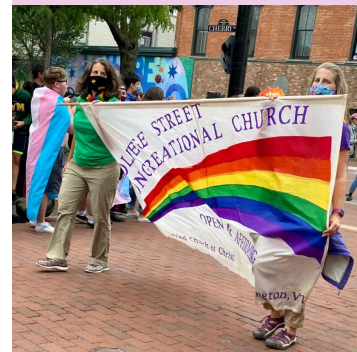
College Street Congregational Church