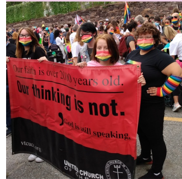
Members of the United Community Church, St. Johnsbury.