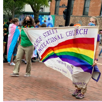
College Street Congregational Church