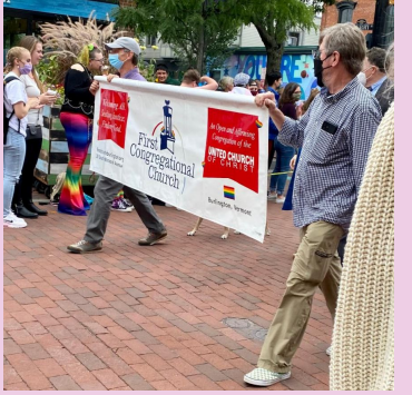
First Congregational of Burlington