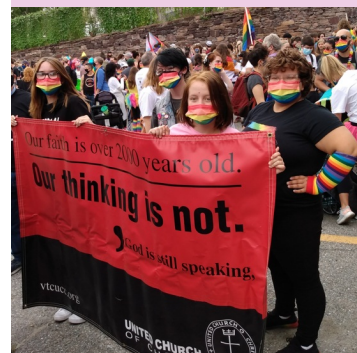
Members of the United Community Church, St. Johnsbury.