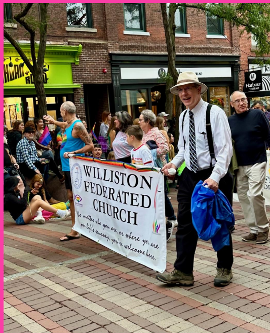
Williston Federated Church