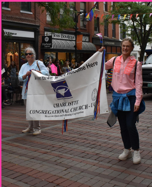
Charlotte Congregational Church, UCC