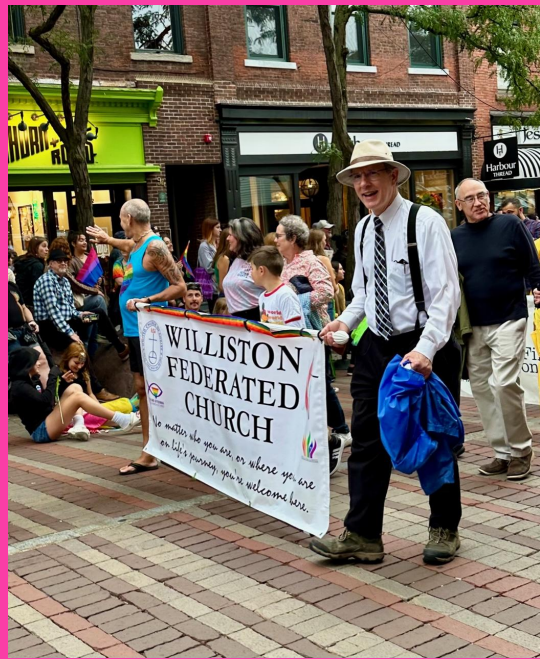
Williston Federated Church