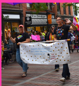
Mallets Bay Congregational Church