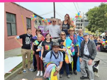
First Congregational Church, Essex Junction