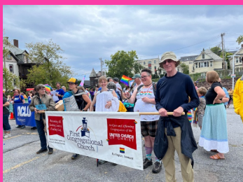
First Congregational Church, Burlington