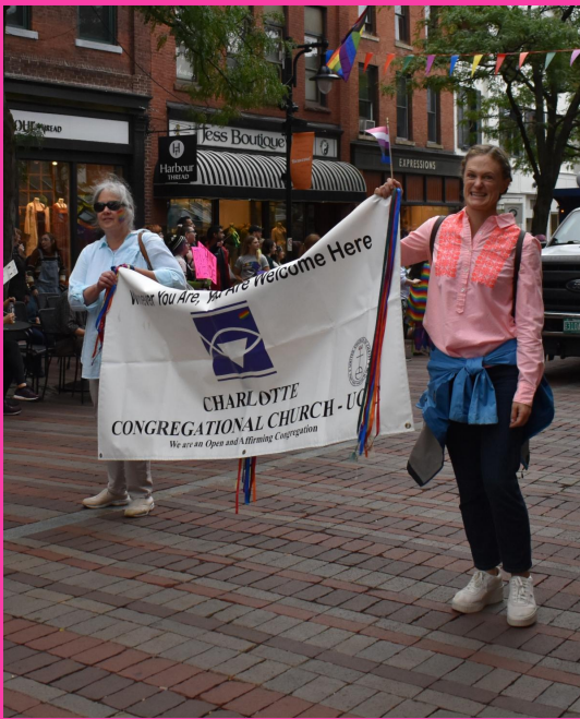
Charlotte Congregational Church, UCC