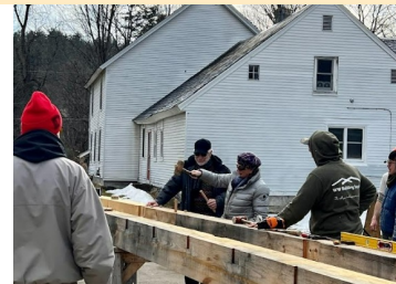
Taking shape, the older folks are watching the younger folks.