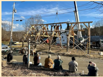
Community members pounding pegs into the timber frame beam.