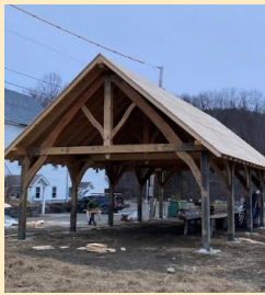
The Pavilion was made with local timber by local craftspeople.

Out of respect for their neighbors' concerns (and as Robert Frost put it, "Good fences make good neighbors") the Hope Fund is helping the Guilford Community Church with the construction of a fence on the park's property line. We are excited to see how this multi-faceted project unfolds. We hope you will make a pilgrimage to the Guilford Community Park, walk the labyrinth and celebrate this amazing project!